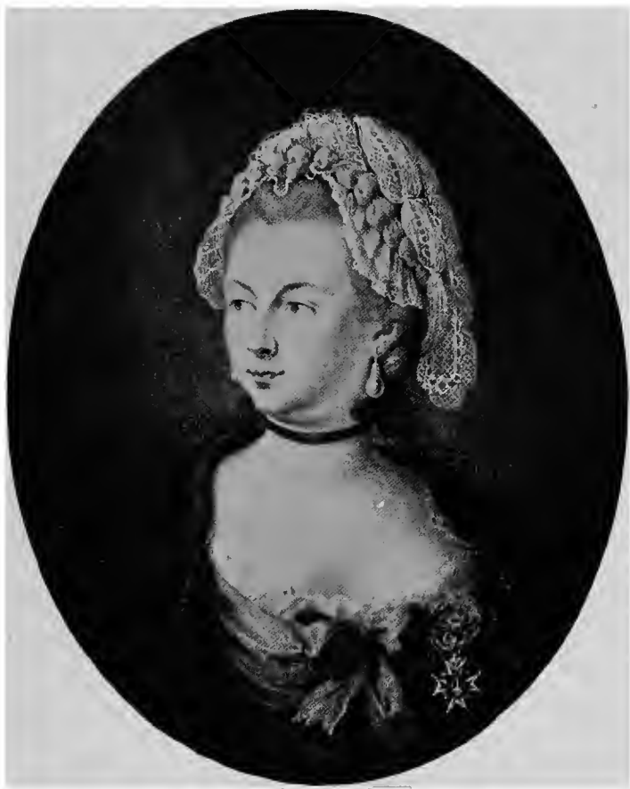
THE CHEVALIER D'ÉON